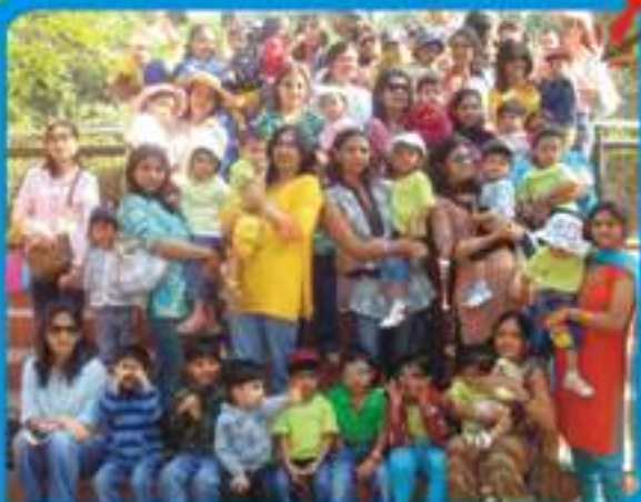
At the Zoo

Here's to a wonderful start to the new year! Come journey with us through the first quarter at Early Birds.