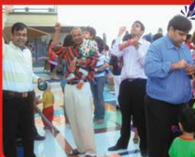
Kite flying with Daddy